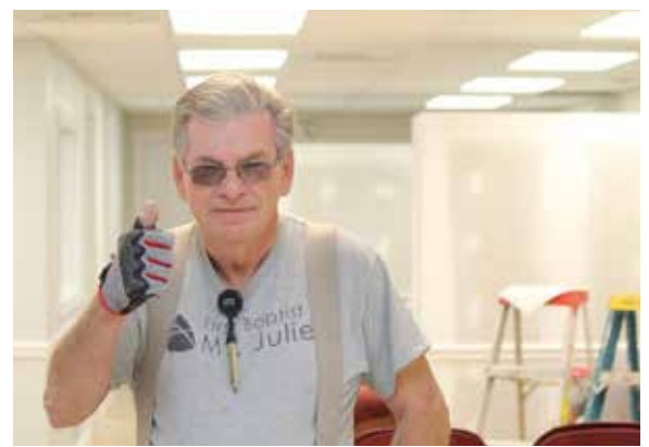
Thank you, COM.