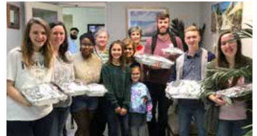
BCF First Lady Continues a Sweet Tradition!