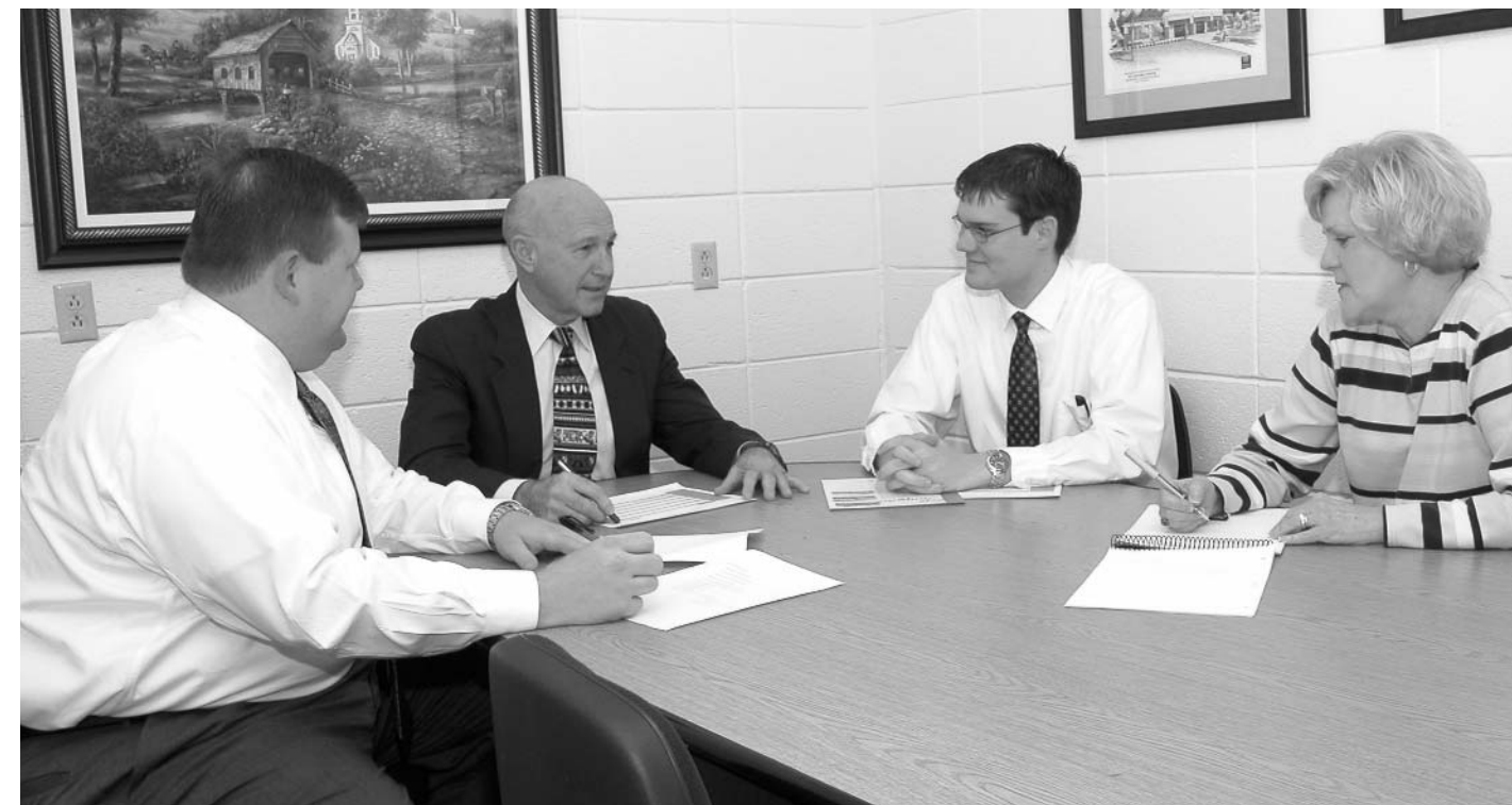
The Institutional Advancement office staff discusses the upcoming "Just Imagine" campaign at a staff meeting.

A long-time friend of the college, BCF's new vice president for institutional advancement chats with the editor of Echoes about his new found responsibilities as a member of the college's administration and what it's like to now be on the inside at BCF.